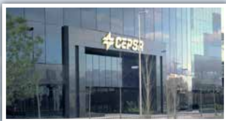
CEPSA Head offices