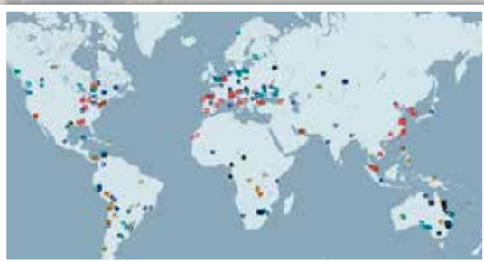
Glencore Xstrata operations map